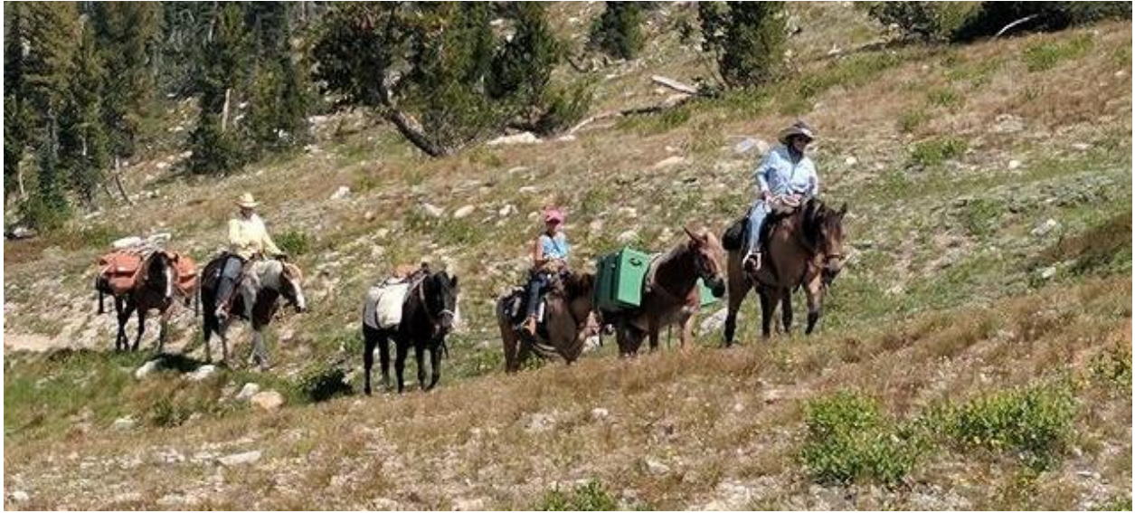
McGown Peak – Pack Support Project – August 26 – September 2, 2017