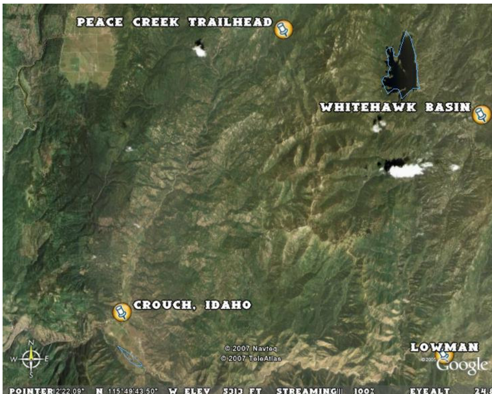
Satellite View of Area

Start at Banks, along State Highway 55. Head east on the Banks-Lowman Highway about 10 miles to the Crouch turnoff. Go north, passing through Crouch on a paved road, which becomes the gravel National Forest Road 698 (NF-698). Continue north on NF-698 to the intersection of NF-671. Go northeast on NF-671 about 8 miles to a trail directional sign, park at the trail sign. There is plenty of room for trailer. There are facilities for horse camping and a FS bathroom.