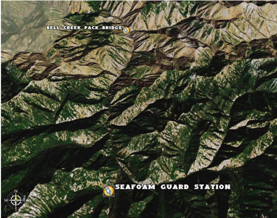
This is a satellite view of the country we'll be traveling through.