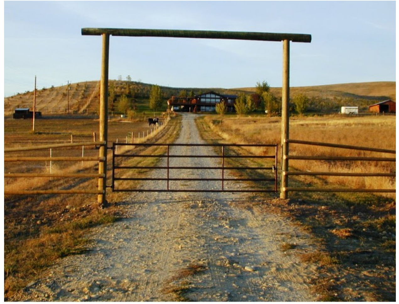
Welcome to the @dams Ranch edit 🛅

It is 12 miles from Emmett, take highway 52 1.5 miles past the Sweet-Ola road intersection. Turn left on to Shelly Ave.