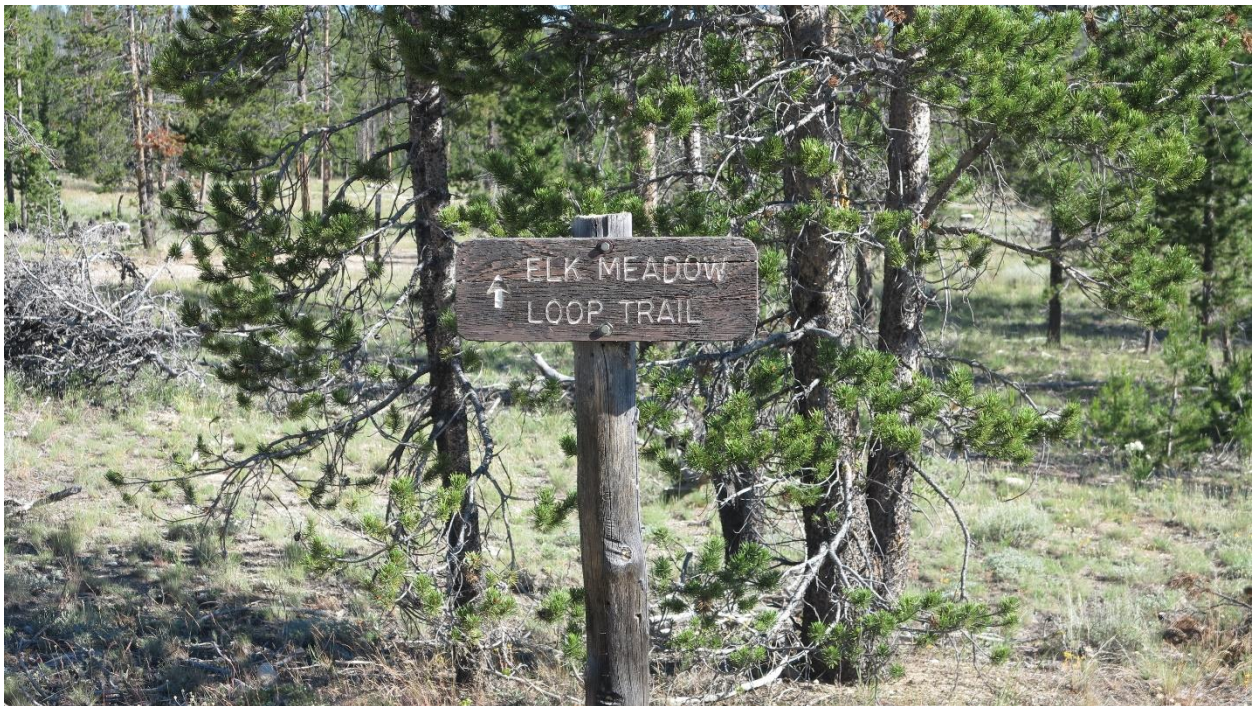
Alpine & Sawtooth Lakes