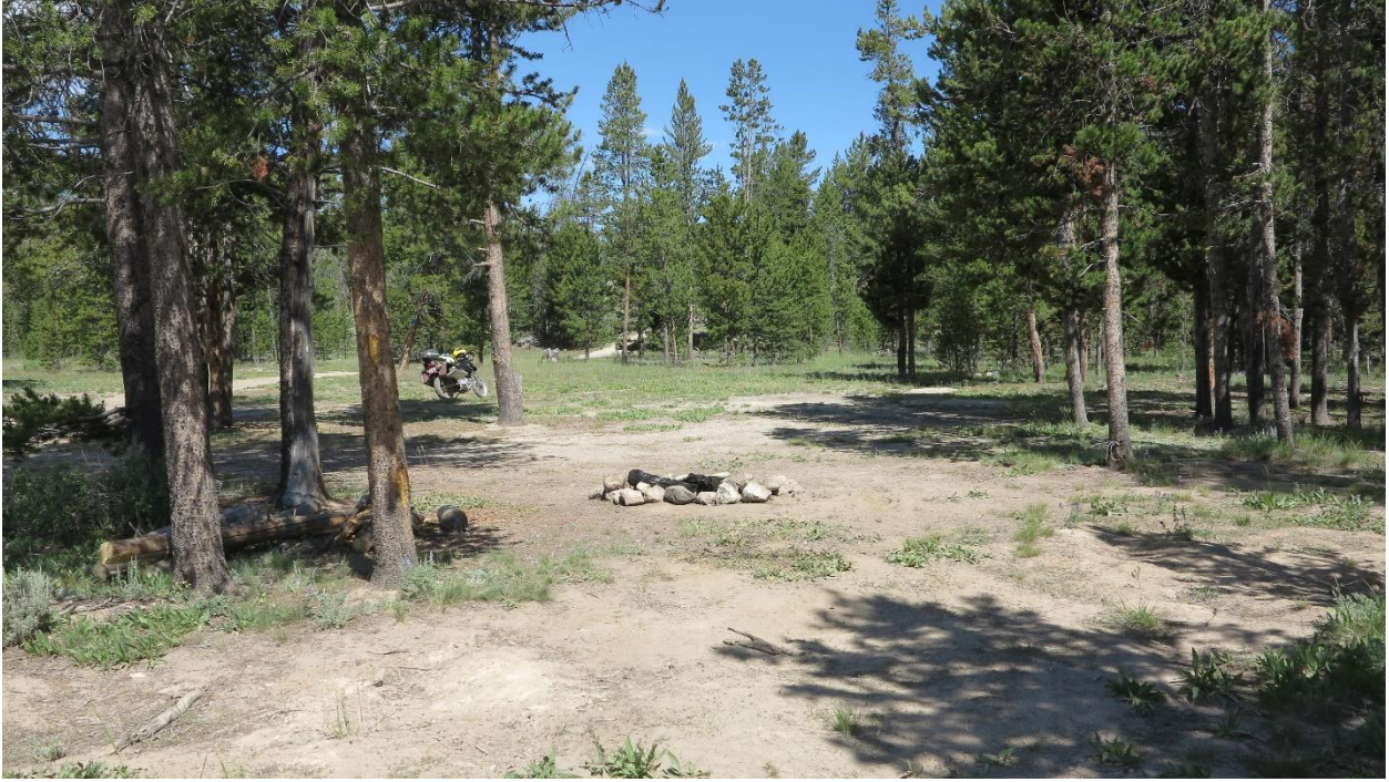
Chick & Lorraine will be leading the rides out of this camp. The Cabin Creek trail head, TR 191 is a short distance away and leads to a group of small lakes.