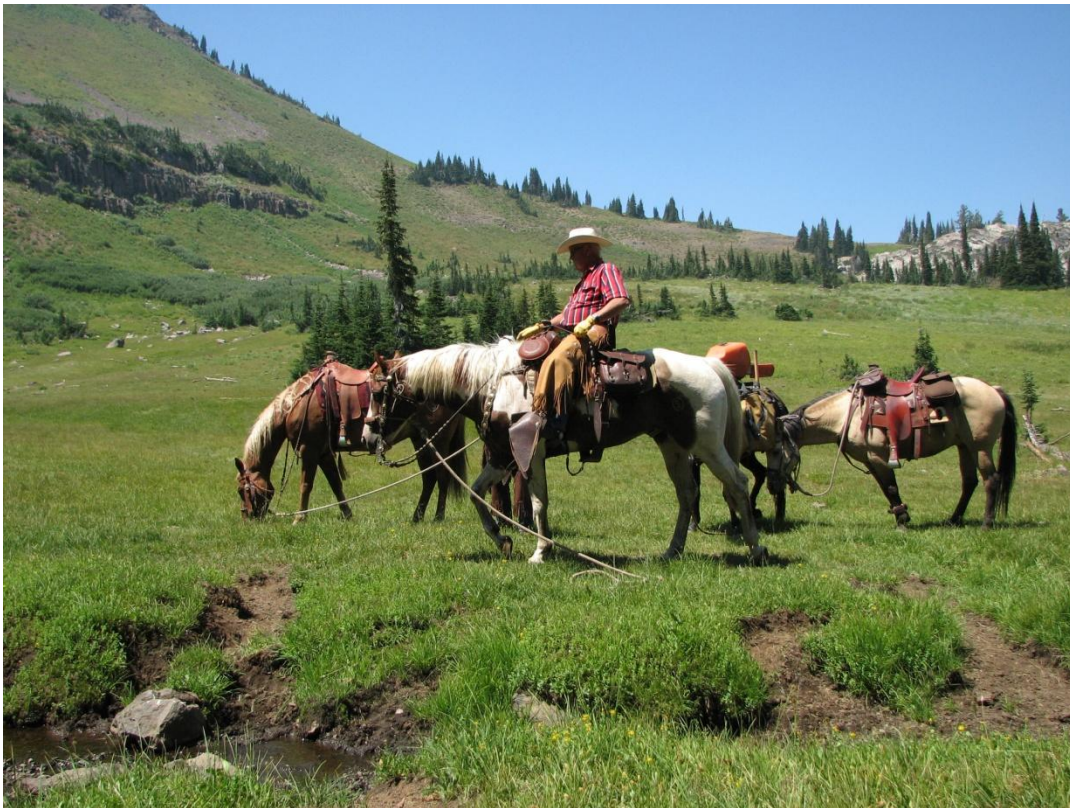
Lake Basin - 2007