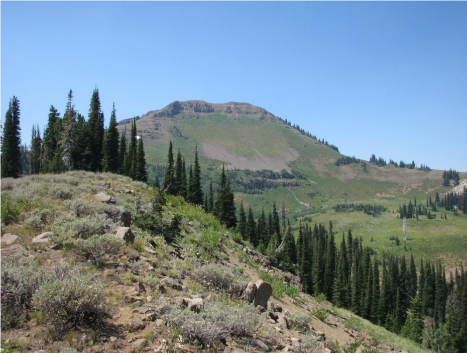
Council Mountain – East side, Lake Basin Below