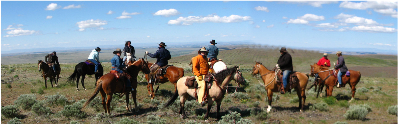
The Wild Horse Gang

Please support the local merchants that support SBBCH