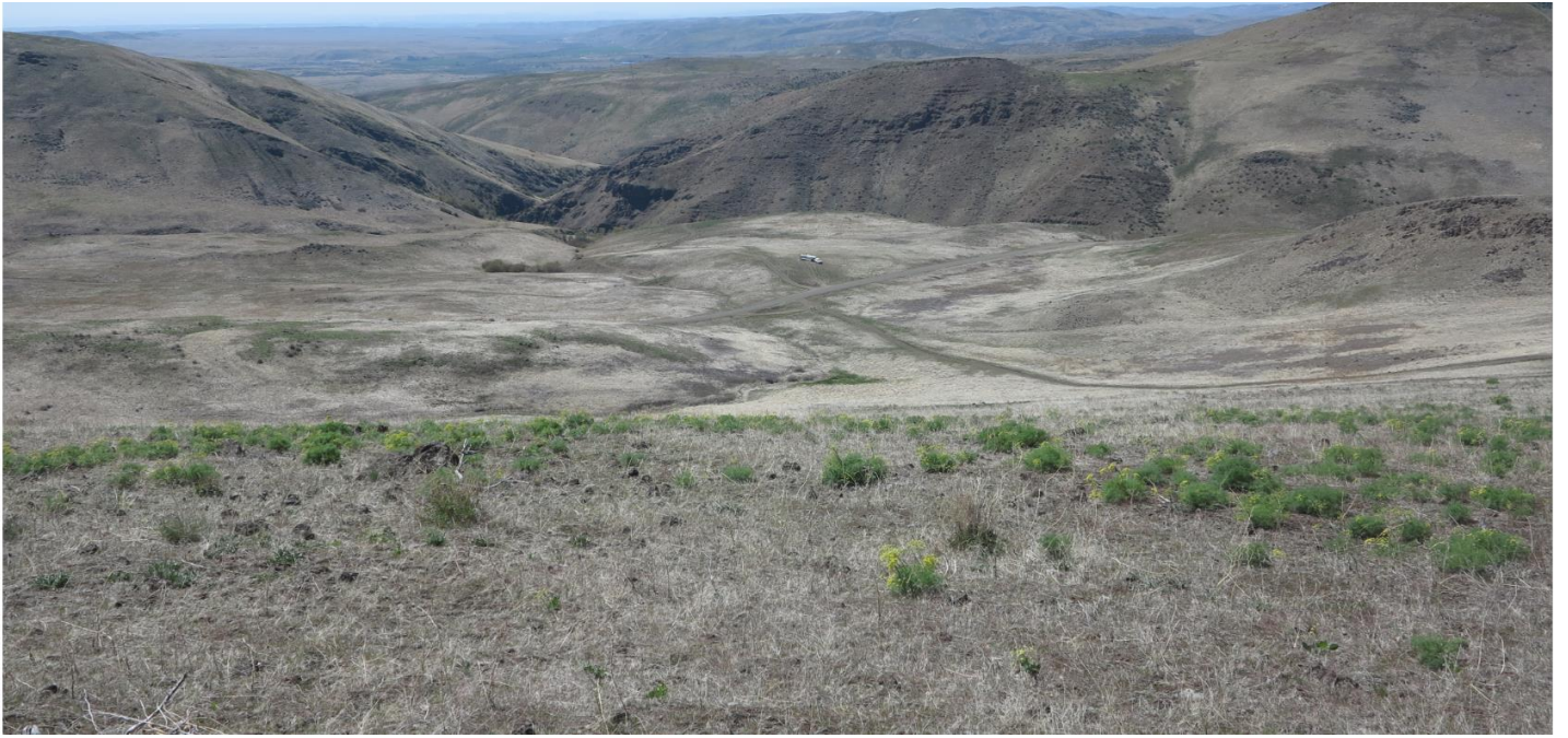
On top of the first ridge looking back west