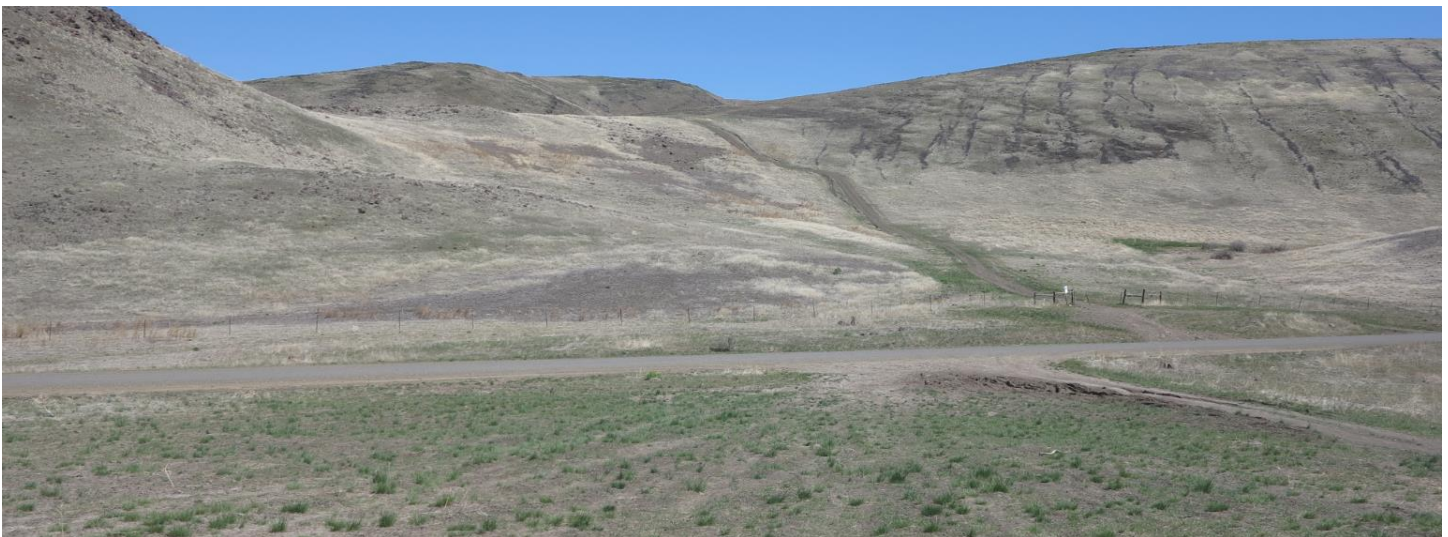
Looking east towards Squaw Butte

The road is quite steep in sections and is a mixture of sand and broken up volcanic rock, so shoes or boots are recommended. The ride is along this road, while there are wildflowers there is not a lot of interesting things to look at.